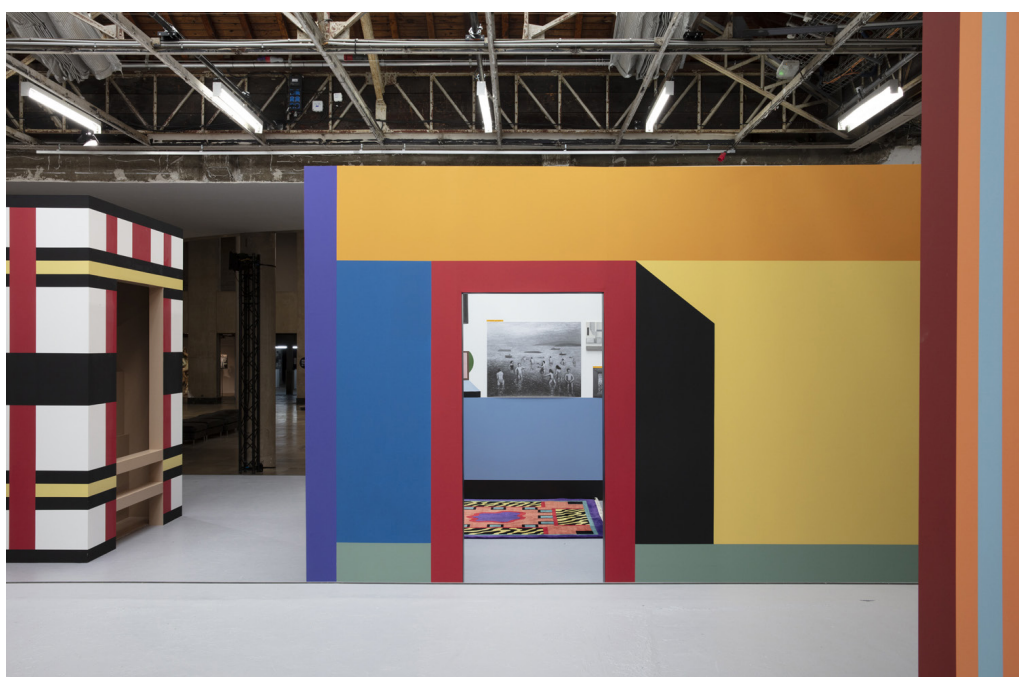
Installation view, Future, Former, Figurative , Palais de Tokyo, Paris, 2019