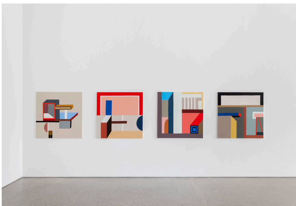
Installation view, No turning here! , Galerie Greta Meert, 2018