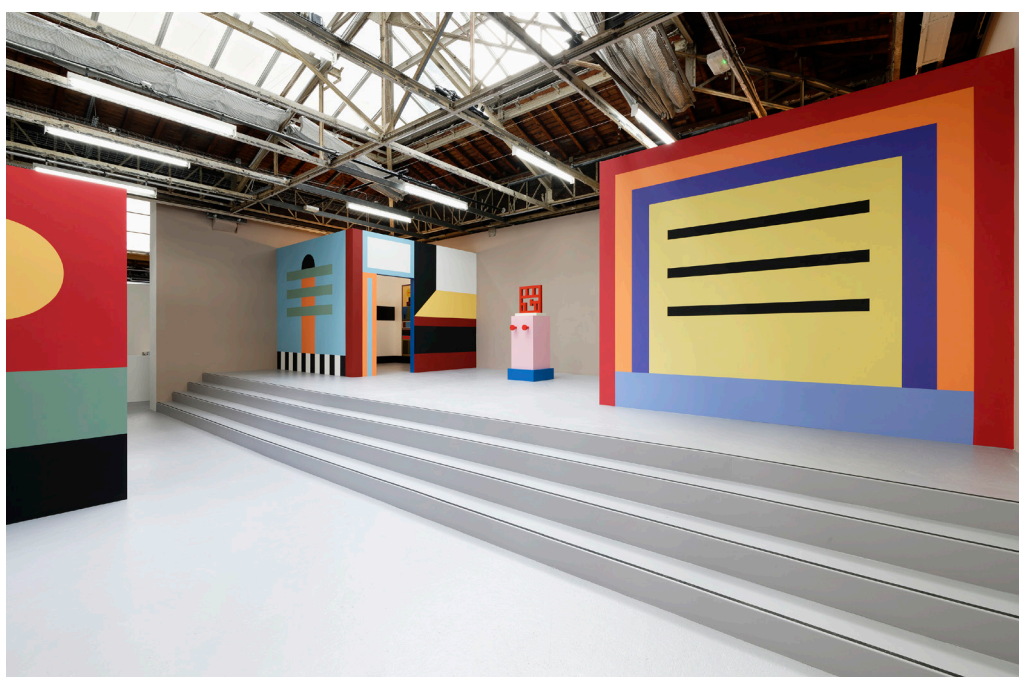
Installation view, Future, Former, Figurative , Palais de Tokyo, Paris, 2019