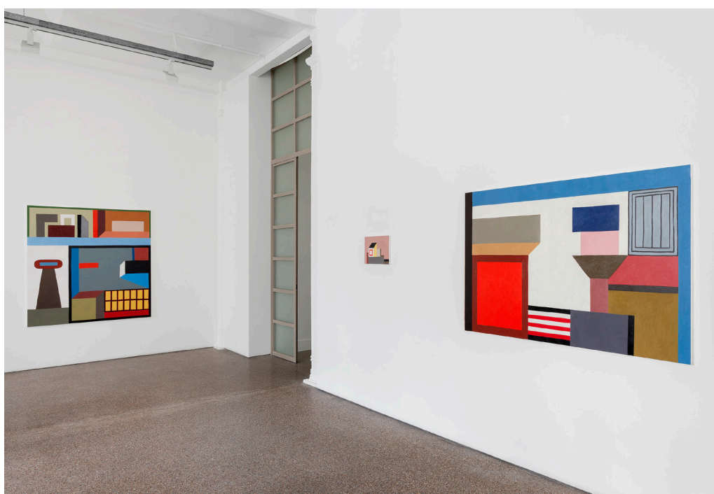
Installation view, No turning here! , Galerie Greta Meert, 2018