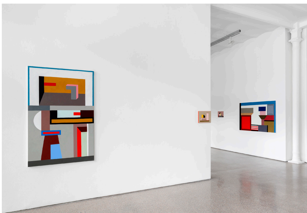
Installation view, No turning here! , Galerie Greta Meert, 2018