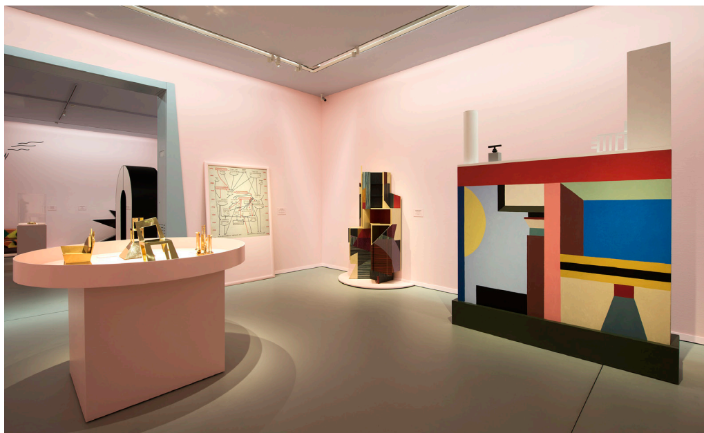
Installation view, Mondo Mendini , Groninger Museum, 2019