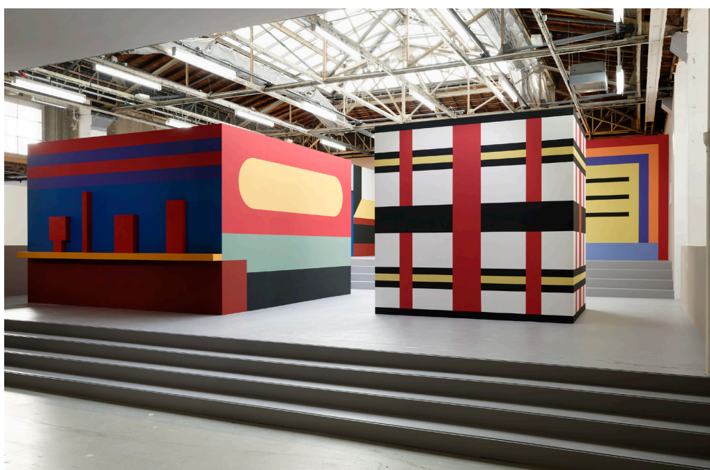
Installation view, Future, Former, Figurative , Palais de Tokyo, Paris, 2019