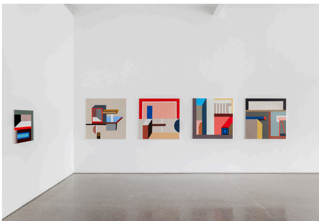
Installation view, No turning here! , Galerie Greta Meert, 2018