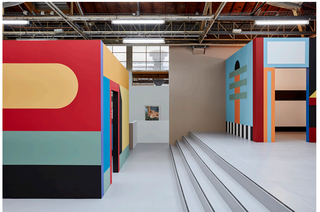
Installation view, Future, Former, Fugitive , Palais de Tokyo, Paris, 2019